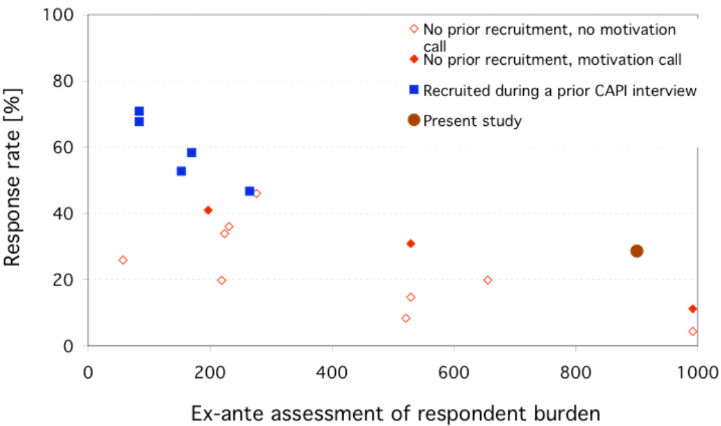
Figure 1 The link between response burden and response rate

The overall response rate is approximately 25%. It is quite low for the Ego-seeds. Here the size of the random sample was too large. All 166 persons got the initial letter at the same time. When 20 persons were recruited the others were not phoned any longer. Therefore a high amount of addresses from the random sample have not been used. In the case of the next subsample this mistake was avoided by sending the initial letter only to a low number of persons. When all these persons have been asked for participation the next initial letters can be sent. Avoiding this mistake could help to increase the response rate. The 25% overall response rate is nearly what has been predicted by the rating system described by Axhausen and Weis (2009).